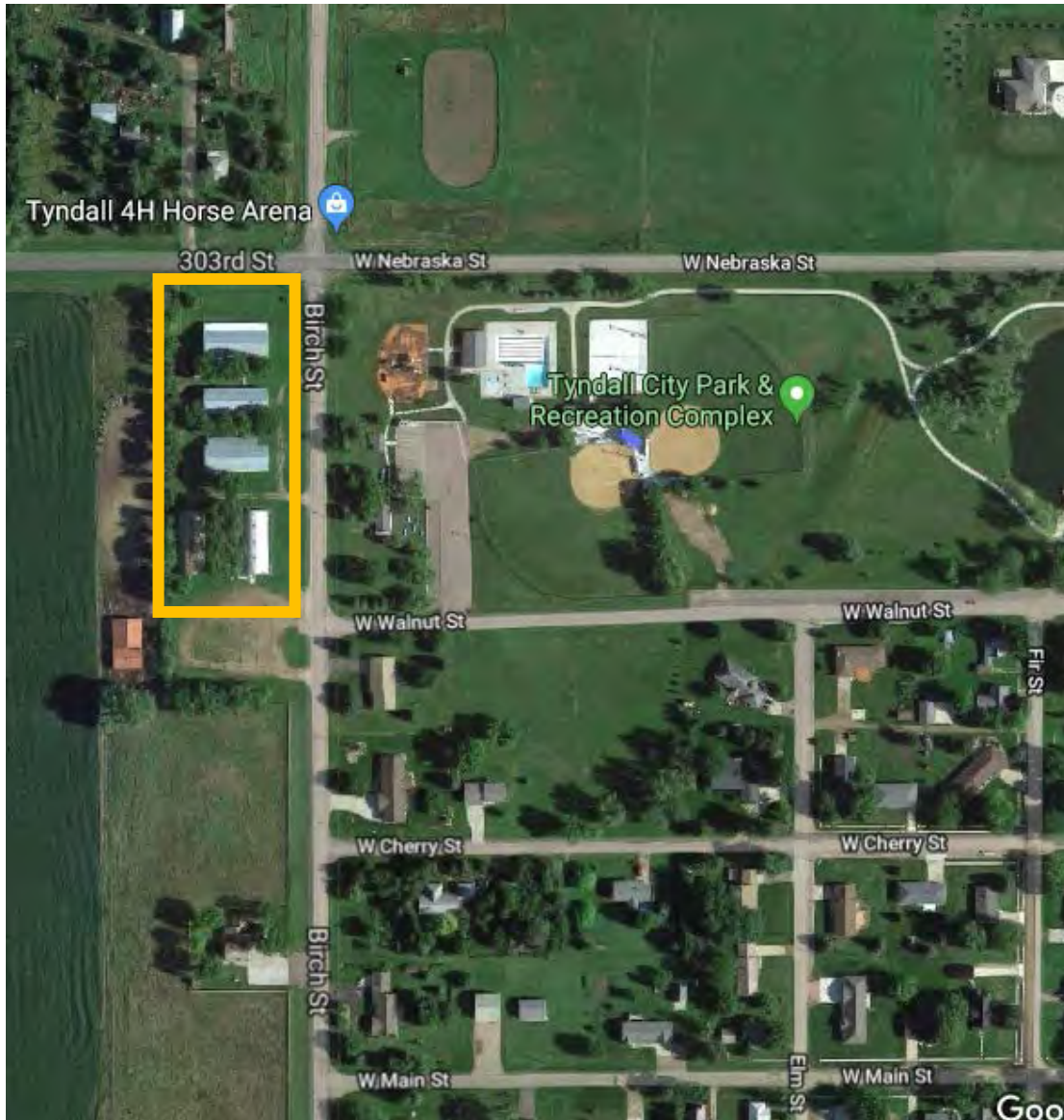
EXHIBIT B – Overhead Satellite Map Depicting Buildings (1 page)